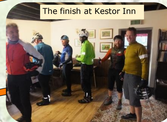
The finish at Kestor Inn