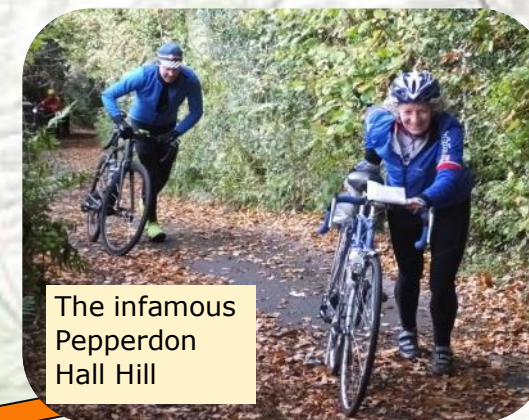
The infamous Pepperdon Hall Hill