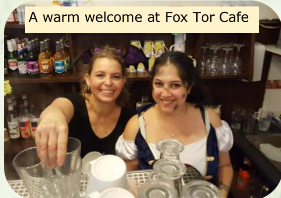
A warm welcome at Fox Tor Cafe