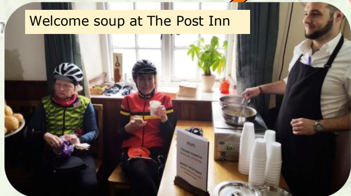
Welcome soup at The Post Inn