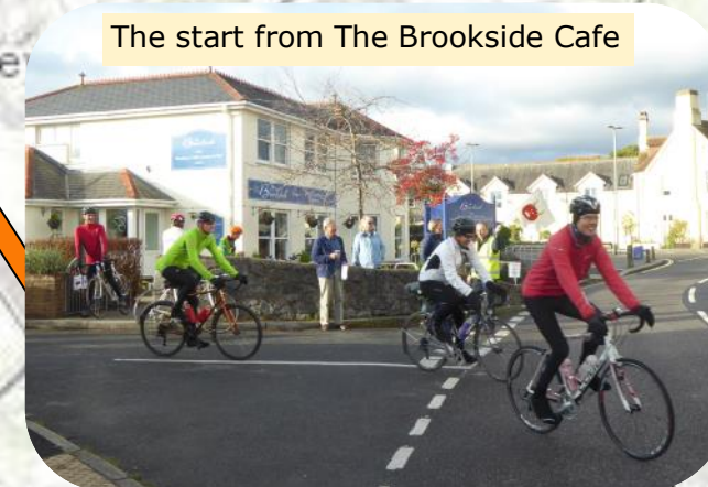
The start from The Brookside Cafe