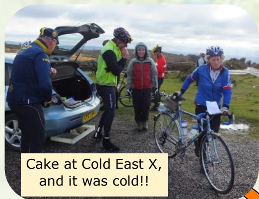
Cake at Cold East X, and it was cold!!